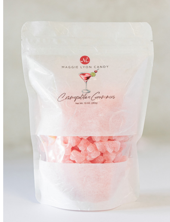
Cosmopolitan Gummi Bears