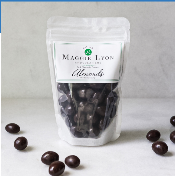
Dark Chocolate Almonds