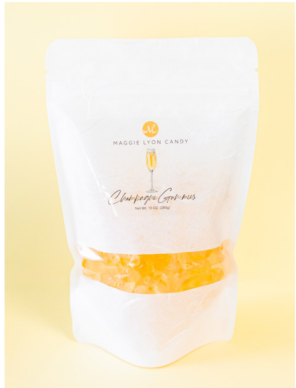
Champagne Gummi Bears