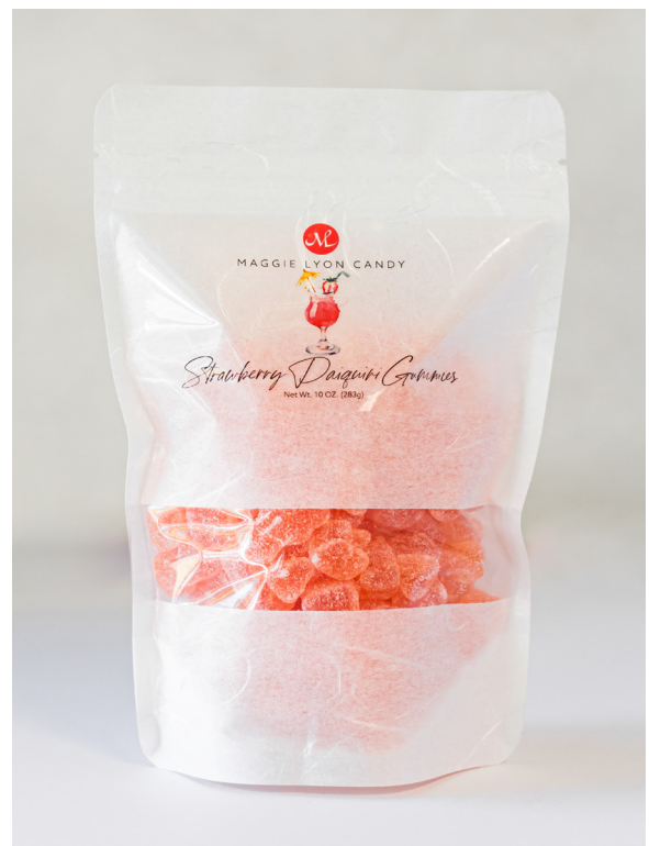
Strawberry Daiquiri Gummi Bears