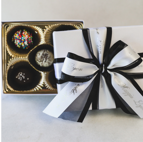
4 Ounce Assorted Truffle Gift Box

5 pieces of assorted truffles come in white boxes that are double tied Maggie Lyon imprinted ribbon.