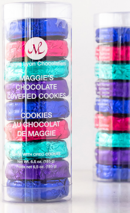
9pc Maggie's Chocolate Covered Cookies in Bright Foil