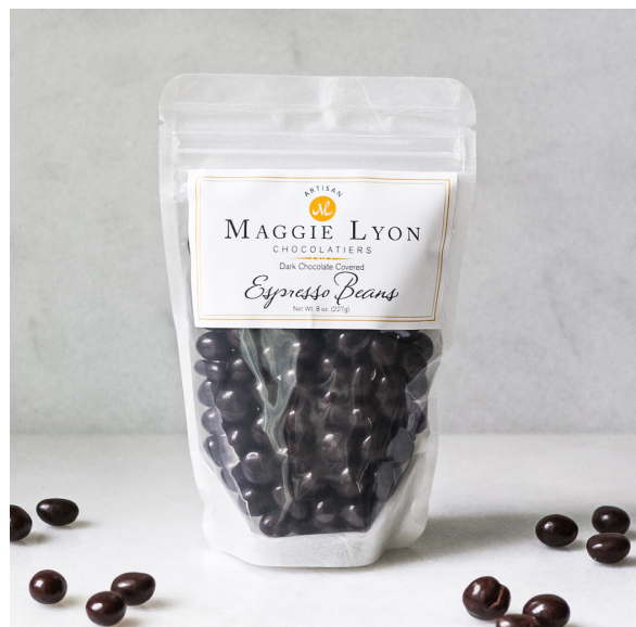
Dark Chocolate Espresso Beans