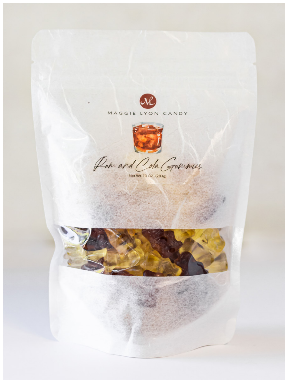
Rum & Cola Gummi Bears