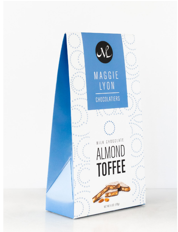
Side View of Gift Box