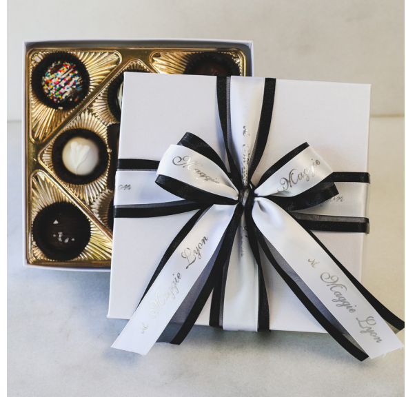
8 Ounce Assorted Truffle Gift Box

9 pieces of assorted truffles come in white boxes that are double tied Maggie Lyon imprinted ribbon.