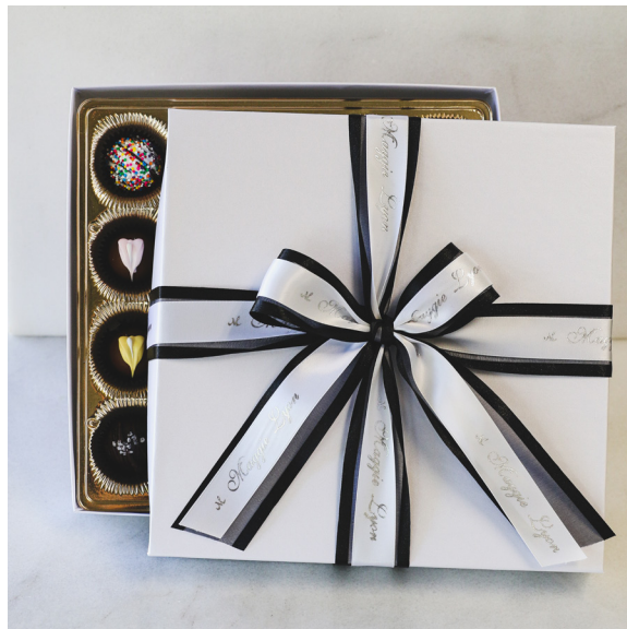
16 Ounce Assorted Truffle Gift Box

19 pieces of assorted truffles come in white boxes that are double tied Maggie Lyon imprinted ribbon.