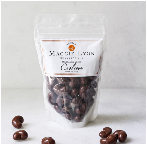
Milk Chocolate Cashews