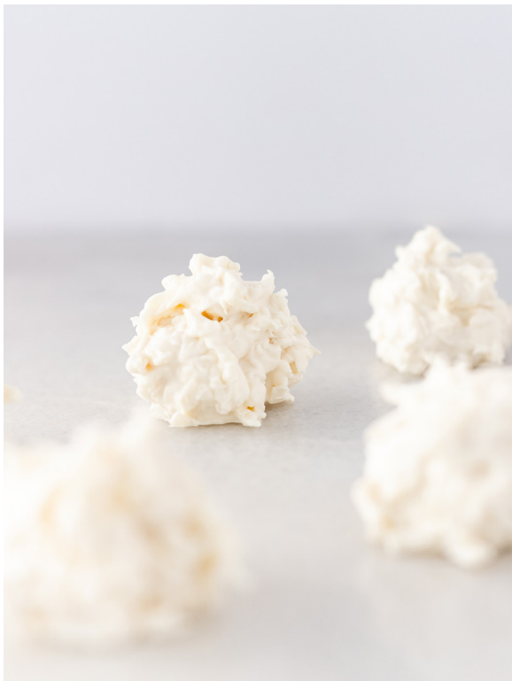
White Chocolate Coconut Haystack Shredded coconut mounds covered in white chocolate. #11353