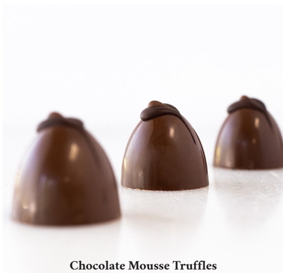
Chocolate Mousse Truffles

Creamy milk chocolate ganache in a smooth milk chocolate shell.