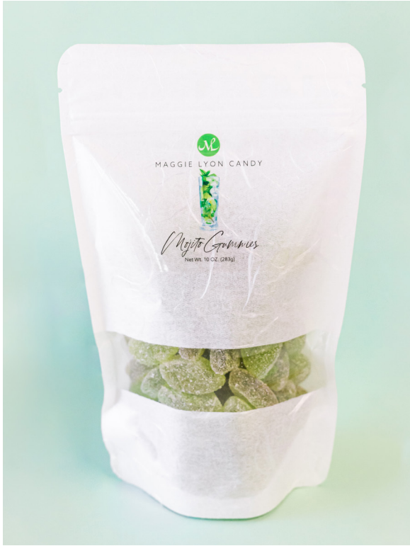
Mojito Gummi Leaves