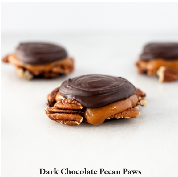
Dark Chocolate Pecan Paws

Pecans and caramel topped with a dark chocolate swirl.