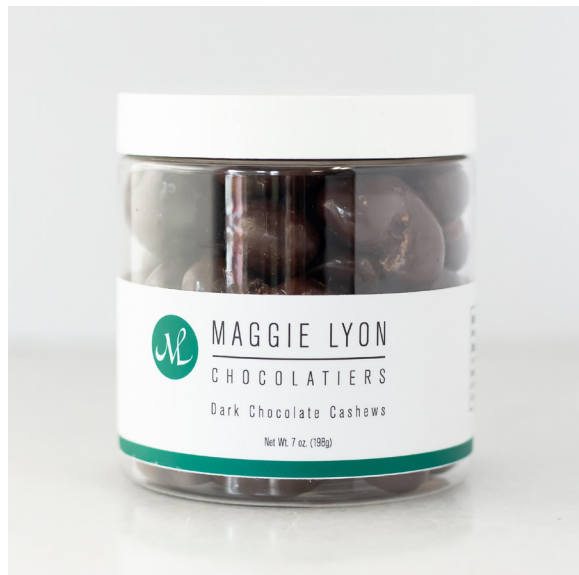
Dark Chocolate Cashews