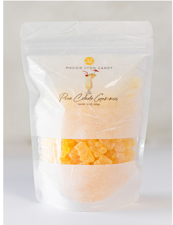
Piña Colada Gummi Bears