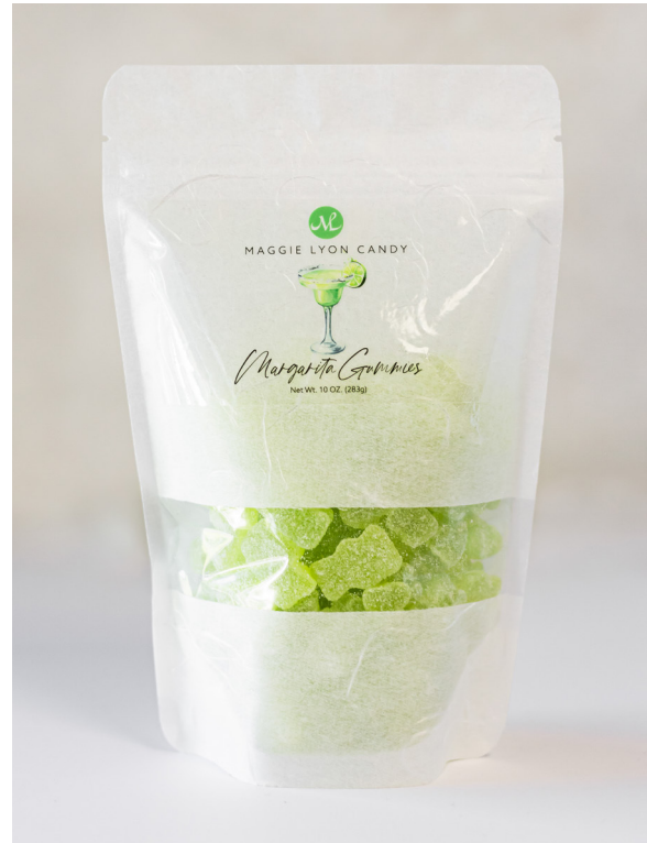
Margarita Gummi Bears