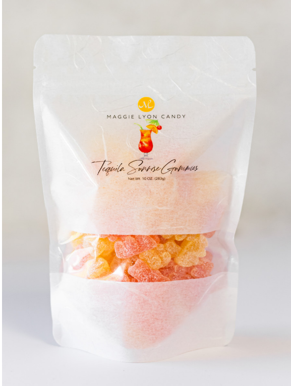
Tequila Sunrise Gummi Bears