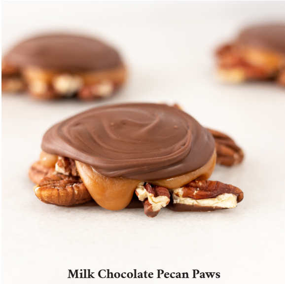
Milk Chocolate Pecan Paws

Pecans and caramel topped with a milk chocolate swirl.