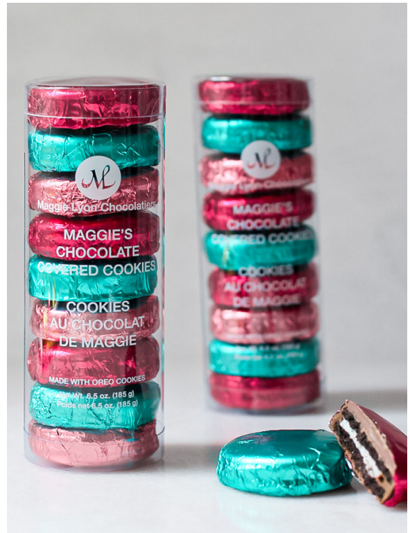
9pc Maggie's Chocolate Covered Cookies in Jewel Tone Foil