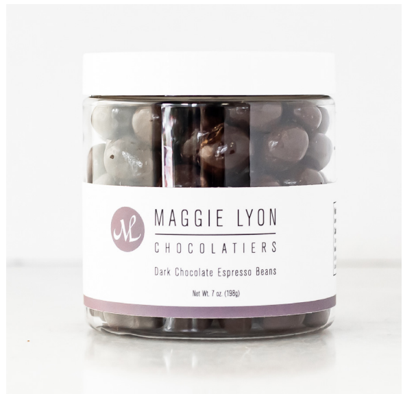
Dark Chocolate Espresso Beans