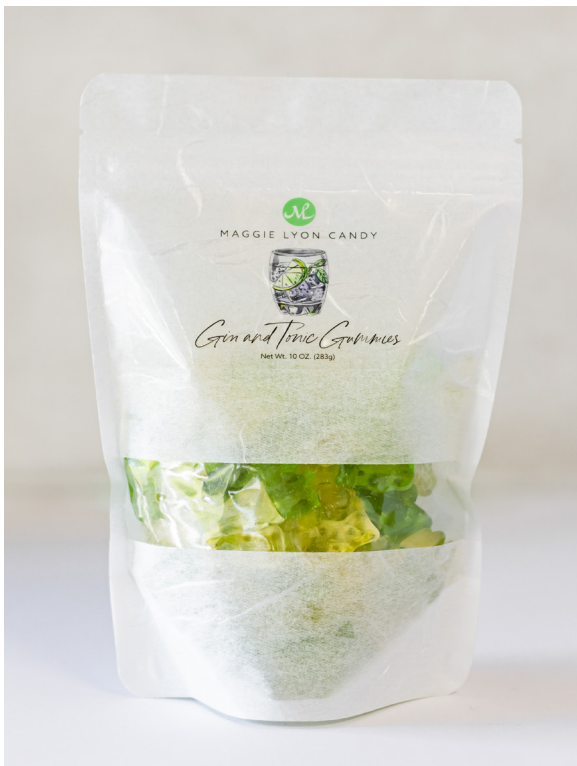
Gin & Tonic Gummi Bears