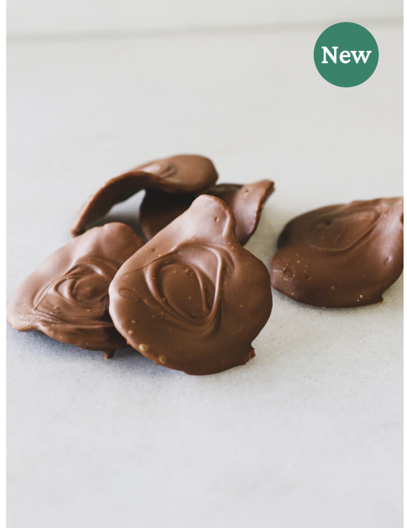
Chocolate Covered Potato Chips Crisp and salty potato chips covered in delicious milk chocolate. #11012