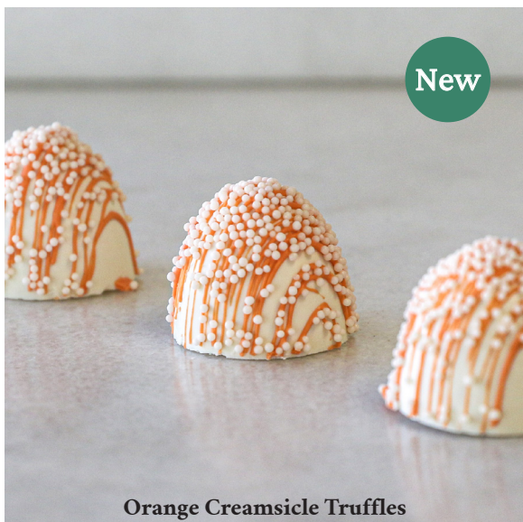
Orange Creamsicle Truffles

White chocolate outer shell and white chocolate ganache center with a sweet orange creamsicle extract.