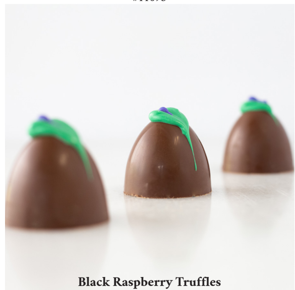
Black Raspberry Truffles

A milk chocolate shell surrounding a dark chocolate ganache flavored with black raspberry.