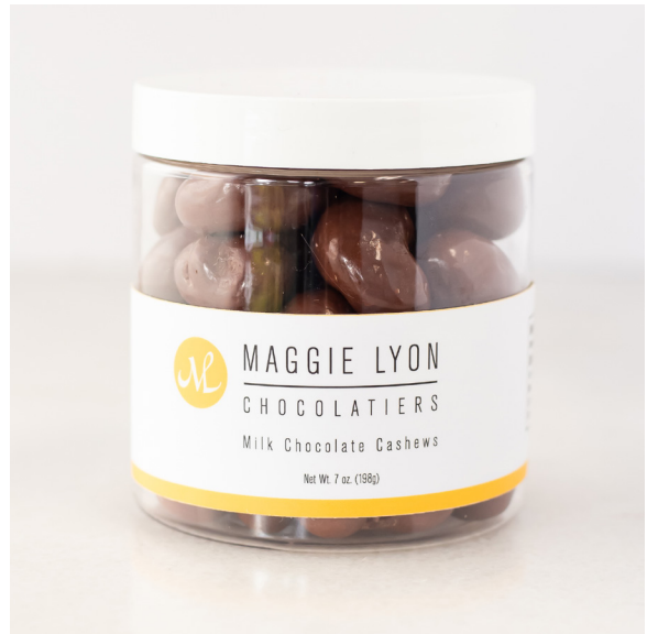
Milk Chocolate Cashews