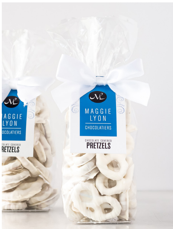
White Chocolate Covered Pretzels