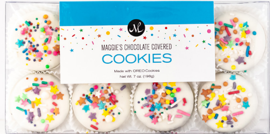
8pc Rainbow Explosion Cookies

An 8 count box of white chocolate covered sandwich cookies with rainbow sprinkles.