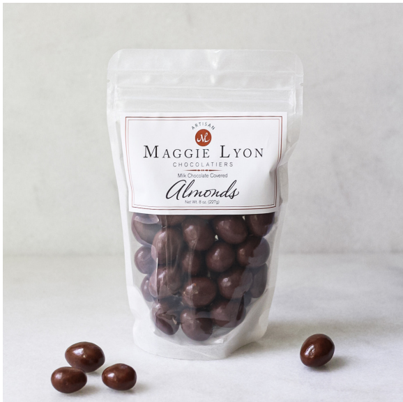
Milk Chocolate Almonds