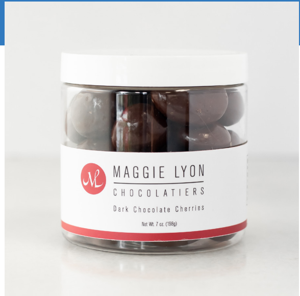
Dark Chocolate Cherries