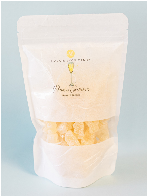
Prosecco Gummi Bears