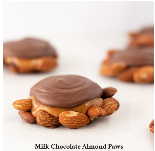
Milk Chocolate Almond Paws

Almonds and caramel topped with a milk chocolate swirl.