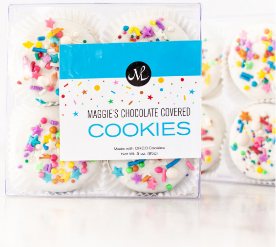
4pc Rainbow Explosion Cookies

A 4 count box of white chocolate covered sandwich cookies with rainbow sprinkles.