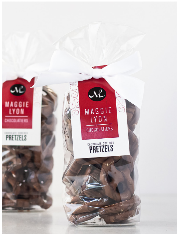
Milk Chocolate Covered Pretzels