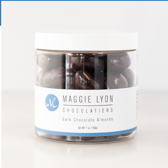
Dark Chocolate Almonds