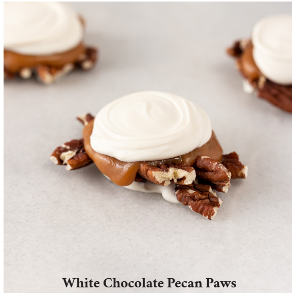
White Chocolate Pecan Paws

Pecans and caramel topped with a white chocolate swirl.