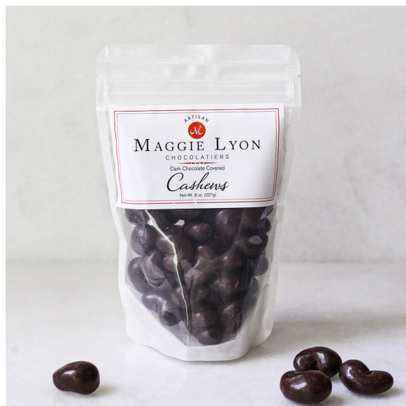
Dark Chocolate Cashews