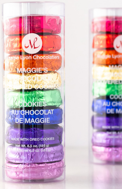
9pc Maggie's Chocolate Covered Cookies in Rainbow Foil