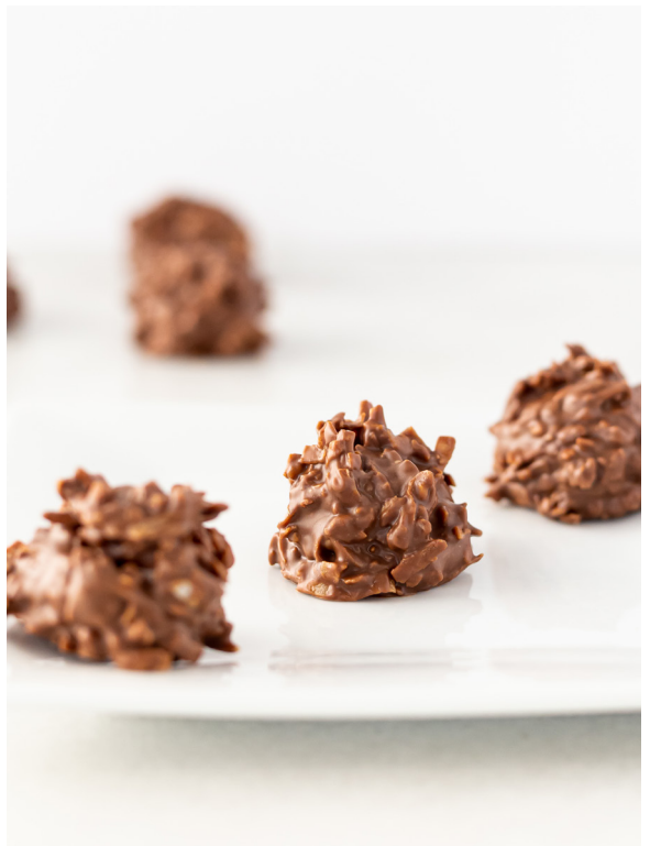
Milk Chocolate Coconut Haystack Shredded coconut mounds covered in milk chocolate. #11352