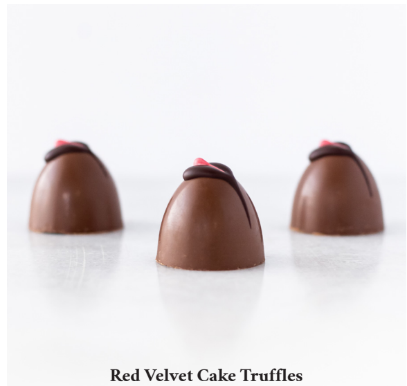
Red Velvet Cake Truffles

A milk chocolate outer shell with a cream cheese and cake flavored white chocolate ganache center.