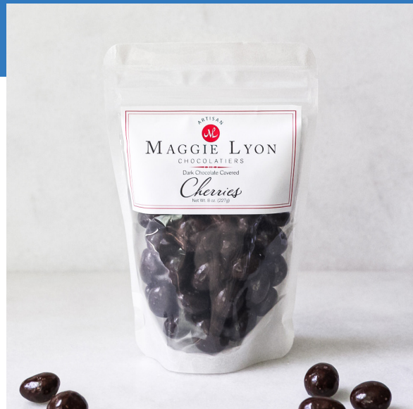
Dark Chocolate Cherries