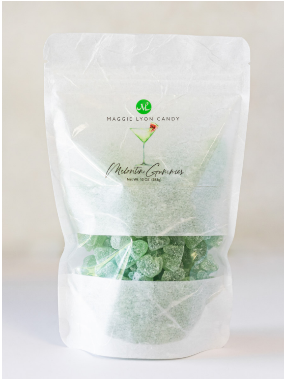
Melontini Gummi Bears