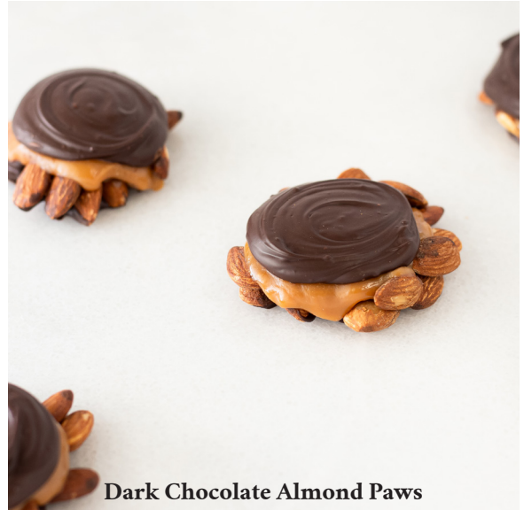
Dark Chocolate Almond Paws

Almonds and caramel topped with a dark chocolate swirl.