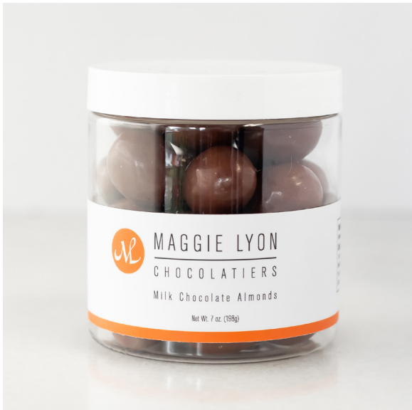
Milk Chocolate Almonds