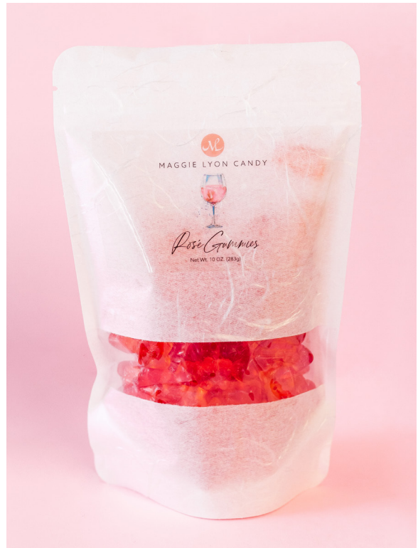
Rosé Gummi Bears